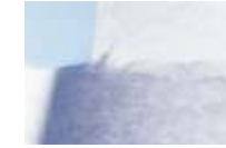
Cellulose paper 40 gr/m2 app. 120 x 205 mm