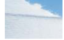
Non woven tissue 38 gr/m2 app: 120 x 160 mm