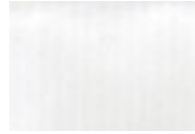
a: Mat white kraft paper