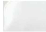
c: Shiny couché paper (mostly used)