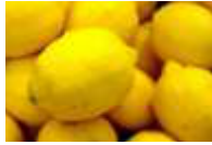
lemon wipes 40% alcohol