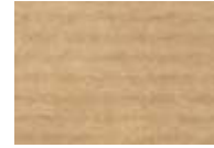
b: Mat brown kraft paper