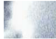
d: Silver aluminium