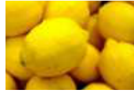
lemon wipes alc. free